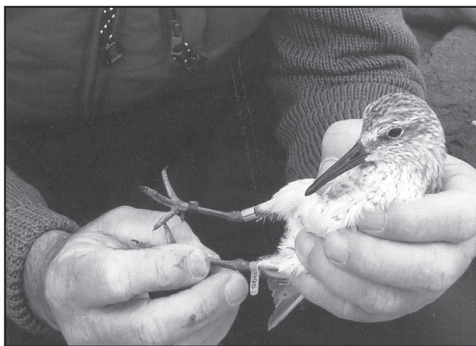
B95, as he appeared in his gray nonbreeding plumage at Rio Grande, November 8, 2007